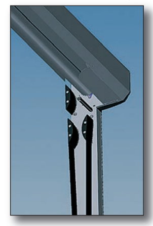
TRAFICONTROL automatic curtain reinsertion technology®

When the curtain goes down, it moves freely between the two flexible guides. Should the door be impacted when closing or opening, it carries on working, reinserts itself and is ready for the next operation. The door can work permanently.