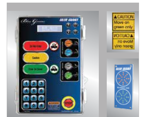
Blue Genius Gold Series III with exterior light and sign