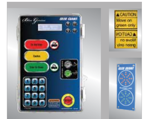
Blue Genius Gold Series I with exterior light and sign